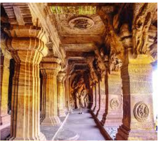
Fillers of Cave-III, Badami