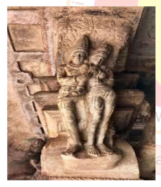
Brocket Figure, Badami