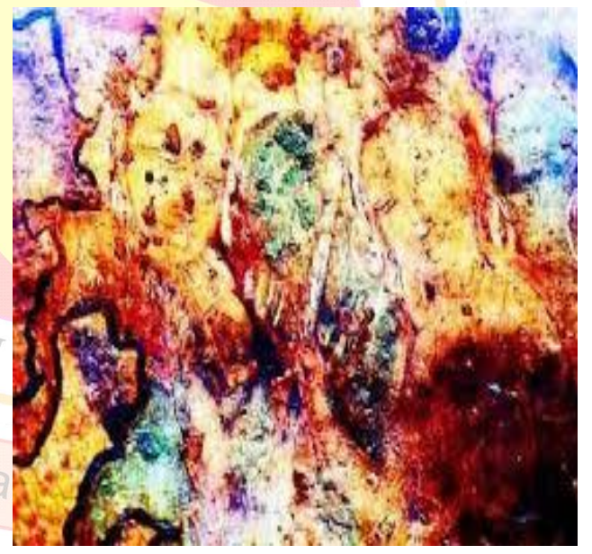
Painting of Cave-III, Badami